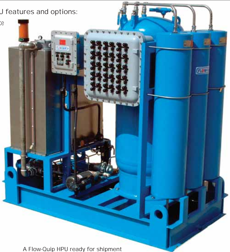
A Flow-Quip HPU ready for shipment to an offshore platform in the Gulf of Mexico.