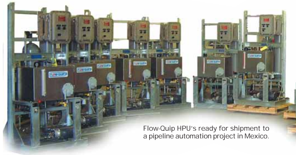
Flow-Quip HPU's ready for shipment to a pipeline automation project in Mexico.